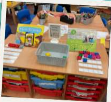
ONLINE SAFETY STORIES