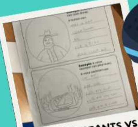
VOICE ASSISTANTS VS HUMANS