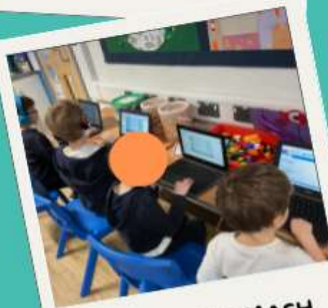
USING PURPLE MASH