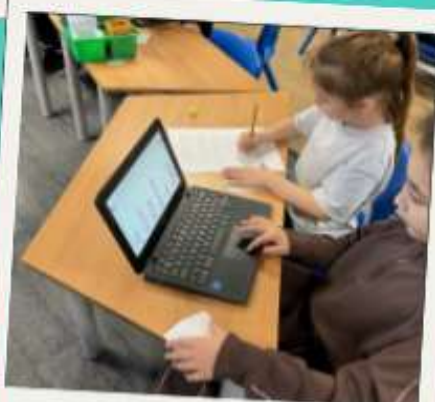
USING TECHNOLOGY SAFELY