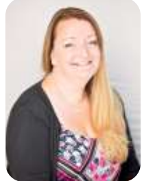
Business Manager & DDSL