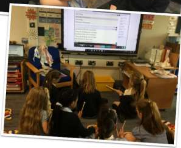
Year 2 children have been learning to play the Glockenspiel. These were bought by the PTA allowing each child to use their own.